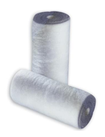
figure 1: Aquatrex filters